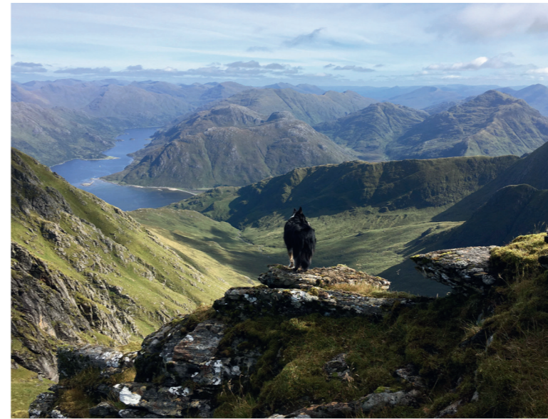
Left: Ladhar Bheinn on the Stob a' Choire Odhair ridge